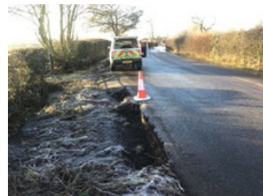
Carriageway damage following flooding.

Our team of locality stewards have been inspecting roads following flooding to ensure they are safe and any defects are raised. They have also worked closely with the emergency services, attending road traffic collisions to ensure the carriageway is cleaned after such incidents.