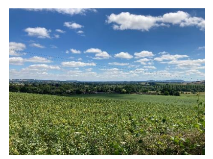
KV10: south-east from Sutton Walls