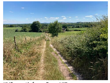
KV9: south from Busy Hill