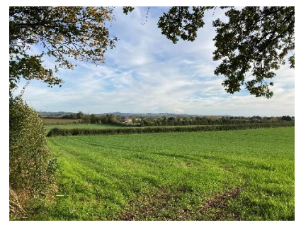
KV11: south-east from bridleway 29