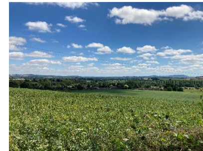
KV10: south-east from Sutton Walls