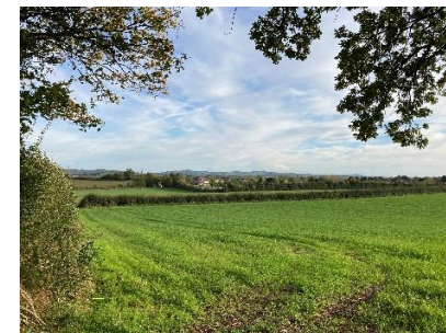
KV11: south-east from bridleway 29