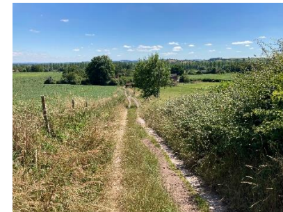
KV9: south from Busy Hill

Policy SUT 13: additional key views KV9, KV10 and KV11